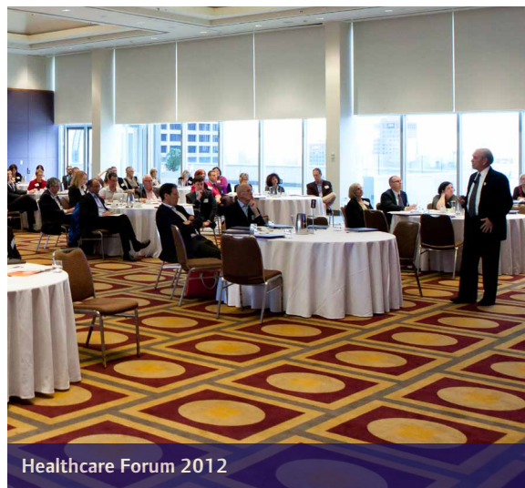
Healthcare Forum 2012