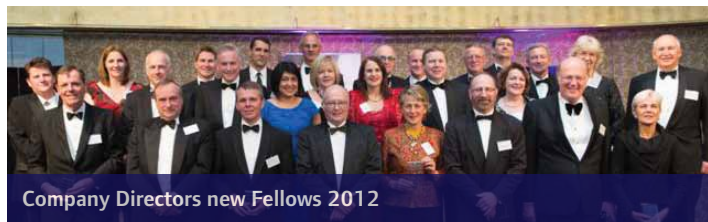
Company Directors new Fellows 2012